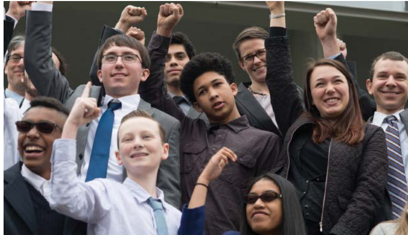
Youth plaintiffs for Juliana v. U.S. at rally.

At one of the critical points in the drama of the Exodus, we find Moses standing on the edge of the Jordan River, just short of the Promised Land, saying to his young apprentice Joshua, “Be strong and bold. For you have been chosen to bring the people into the new land, not I.” Moses had seen God’s people out of Egypt and through a decades-long wilderness journey. Now, God had commissioned a leader from the next generation to guide them into a new land and a new life. The younger generations who were to settle in the new land would have very different lives than