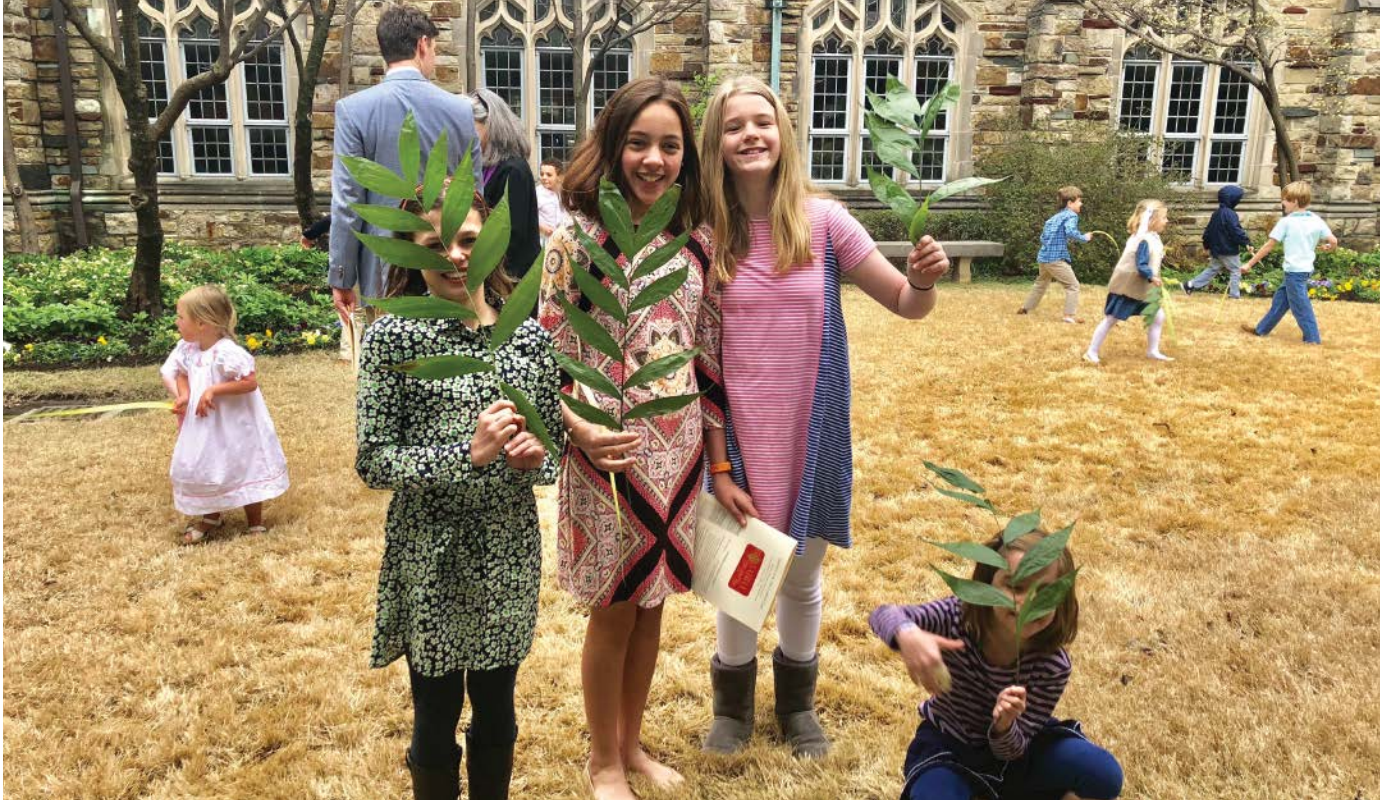
Palm Sunday Idlewood Presbyterian Church.