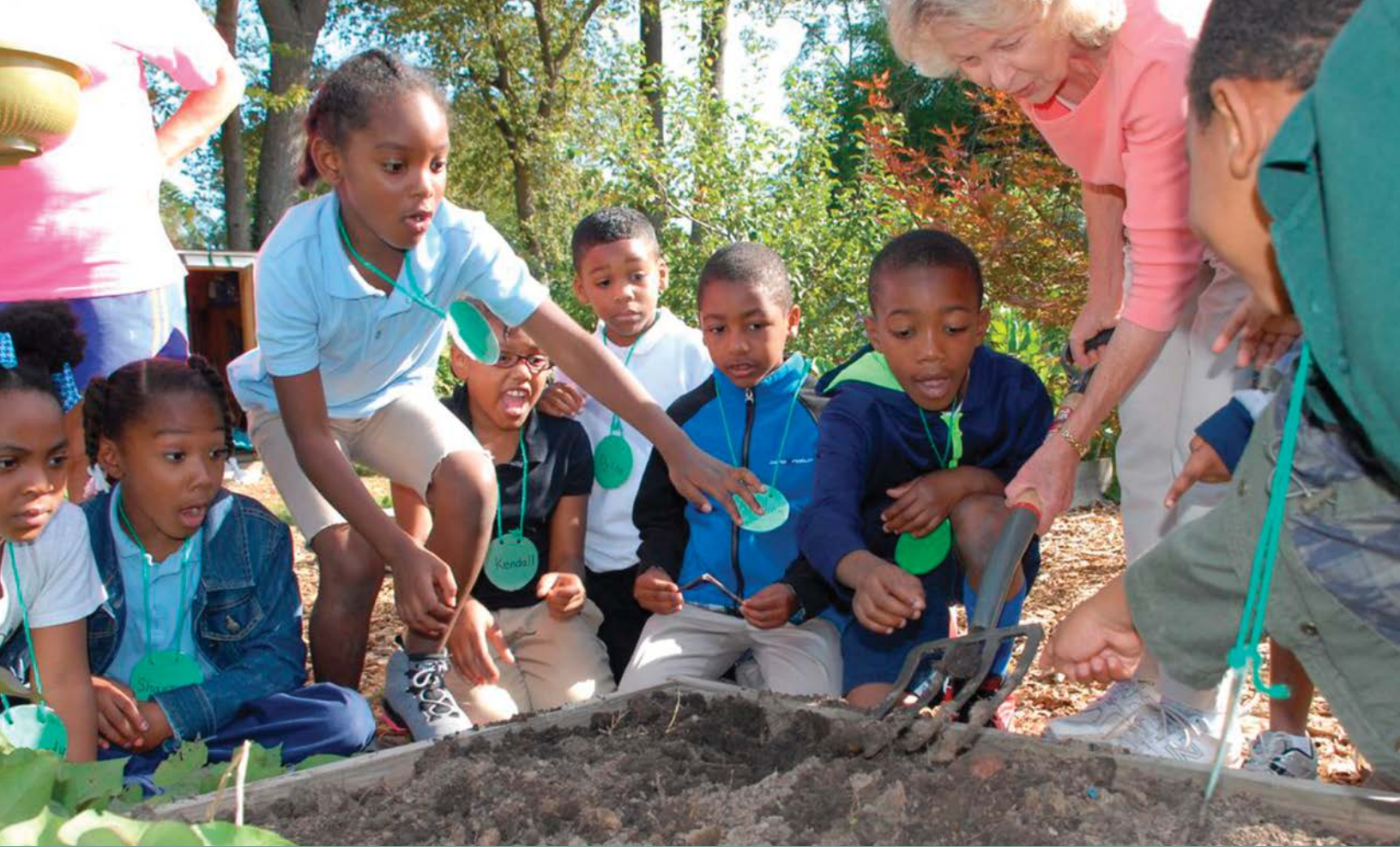
Youth at Second Presbyterian Church in MO.