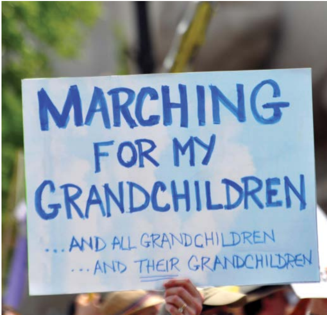
Climate March 2017.