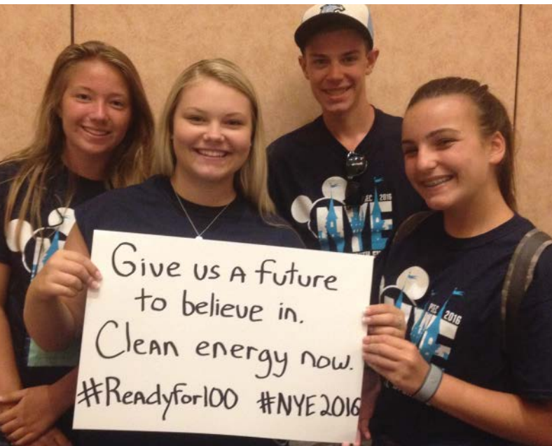
National Youth Event of the United Church of Christ.

Reflect: What fresh ideas does the next generation have for helping to lead us into a Promised Land of abundance for all creation? Are the other generations listening? How are we empowering the next generation to share their creativity, energy, and vision?