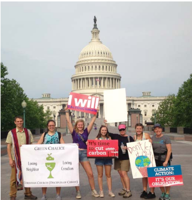
Youth at climate march outside United States Capitol.