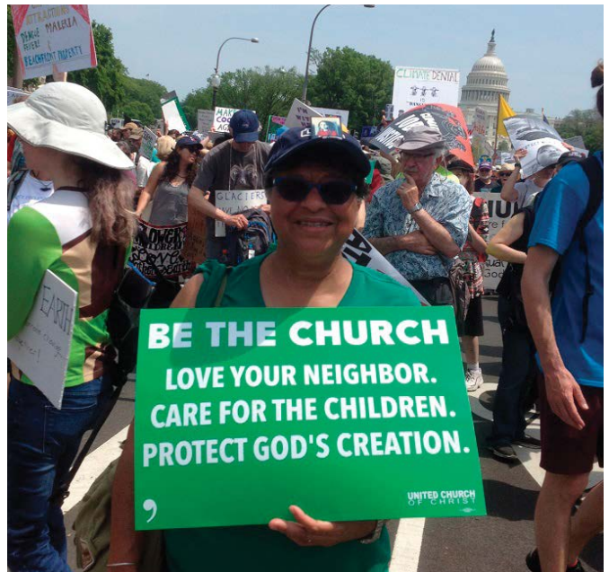
2017 Climate March in Washington, DC.