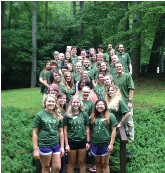
Youth at SOIL Conference.

The reason Camp Stevens, an Episcopal camp in Southern California, started a recycling and compost program is because of young people. These young people saw a gap in opportunity and sustainability, developed the ideas into a system and a program, and then rallied the camp leadership to make it happen. Today, children collect chicken eggs, sift compost, plant and harvest produce, and eat camp out meals from re-used kitchen containers because of the courage and ingenuity of their peers!