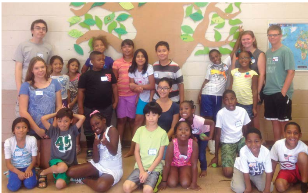
Creation-themed arts camp at Community Reformed Church, Manhasset, NY.

At camps across the country, youth are learning to love and care for the earth through gardening and animal husbandry. By playing alongside chickens, feeding pigs compost, harvesting carrots for a campout meal, and collecting eggs for breakfast they inherently build relationships with the land and the Creator. These lessons carry on into adulthood.